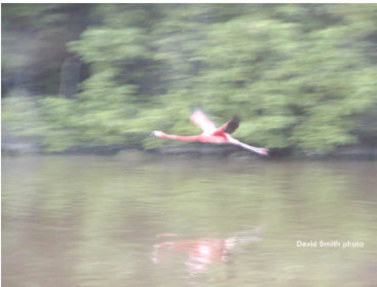
Figure 2 Flamingo in flight