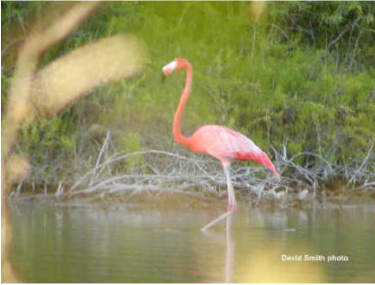
Figure 3 Flamingo wading