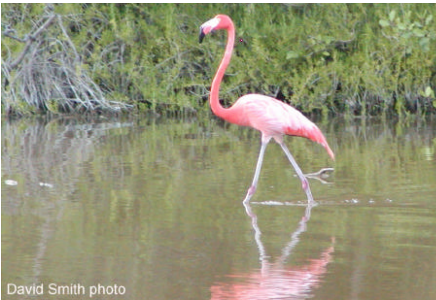
Figure 4 Flamingo moving to new wading area